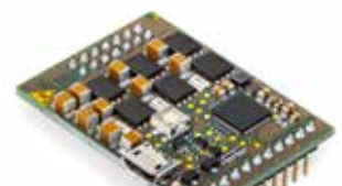
ESCON Module 50/4 EC-S 446925