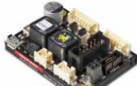
ESCON 36/2 DC 403112