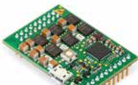
ESCON Module 50/5 438725