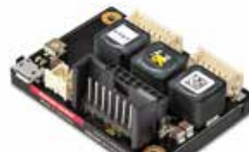
ESCON 36/3 EC 414533