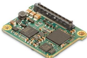
EPOS4 Micro 24/5 EtherCAT positioning controller