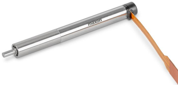
maxon ECX Speed 4 with gearhead and encoder