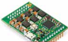
ESCON Module 50/5 438725