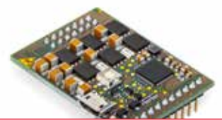
ESCON Module 50/4 EC-S 446925