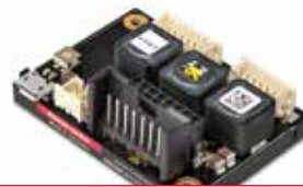
ESCON 36/3 EC 414533