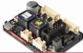
ESCON 36/2 DC 403112