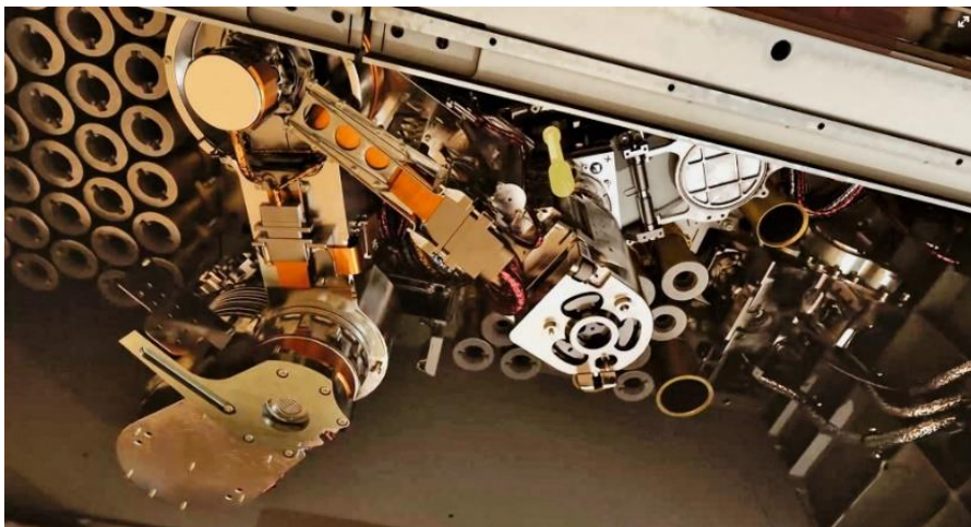
The robotic arm moves the soil samples to the volume assessment and scanning stations, then to the sealing station, and finally into temporary storage—all autonomously.