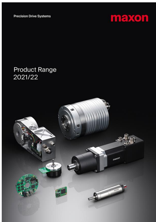
The new maxon product catalog 2021/2022